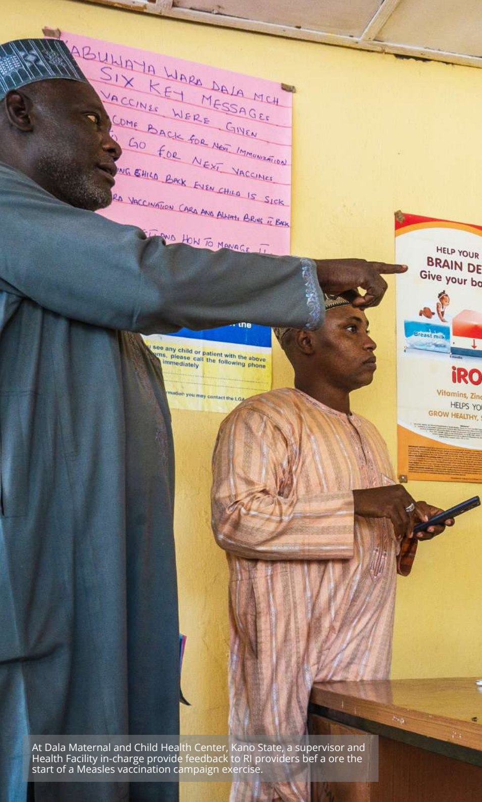
At Dala Maternal and Child Health Center, Kano State, a supervisor and Health Facility in-charge provide feedback to RI providers before the start of a Measles vaccination campaign exercise.